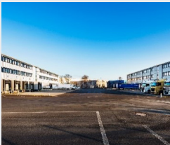
Greiwing, CM & Dolphin Duisburg, Germany 17,845 sqm