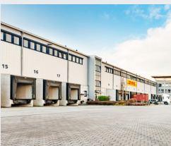
DHL Unna I Unna, Germany 133,871 sqm