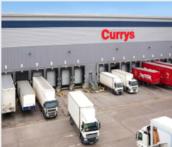
DSG Bristol, UK 25,106 sqm