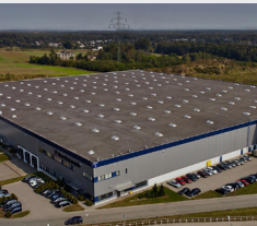
DP Portfolio Mysłowice Silesia, Poland 27,981 sqm