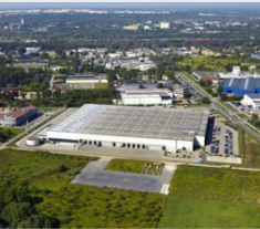
Distribution Park Annapol Warsaw, Poland 7,138 sqm