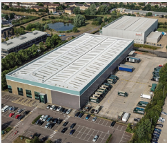
JLP Enfield Greater London, UK 8,045 sqm