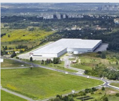
Distribution Park Sosnowiec Sosnowiec, PL 47,100 sqm