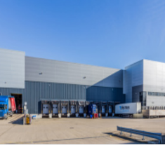
Charles Tyrwhitt Milton Keynes, UK 12,949 sqm