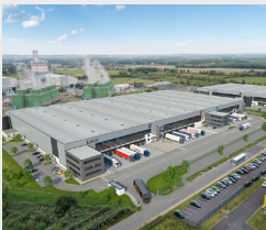
Distribution Park Hamm Hamm, Germany 68,500 sqm