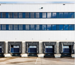
Rhenus Bingen I Bingen, Germany 44,036 sqm