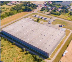
DP Portfolio Grodzisk Mazowiecki Warsaw, Poland 16,030 sqm