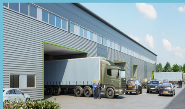
Investment-grade developments, built to the latest standards with the highest environmental credentials