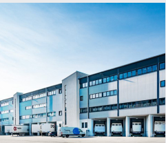
ITG Airport Munich Munich, Germany 46,215 sqm