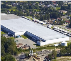
Distribution Park Będzin Katowice, Poland 54,545 sqm