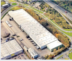
Cribbs Causeway Bristol, UK 40,152 sqm