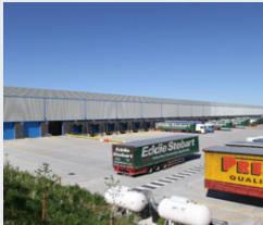
ITPL Wakefield, UK 19,241 sqm