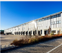
Cordes & Graefe, Unna III Unna, Germany 17,845 sqm