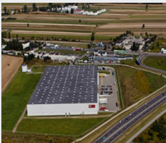
DP Portfolio Garwolin Warsaw, Poland 25,940 sqm