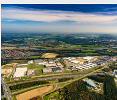
Fresh Park Venlo Venlo, NL 266,040 sqm