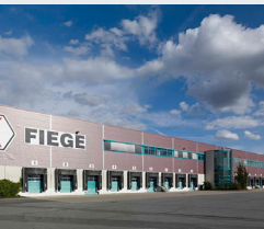
Fiege Mega Center Erfurt, Germany 88,500 sqm