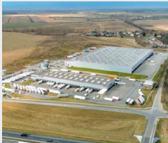
Segro Logistics Park Gdańsk, Poland 32,200 sqm