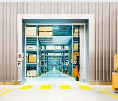
Siemens Berlin Berlin, Germany 25,843 sqm