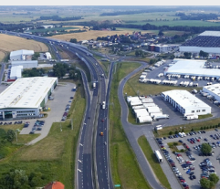
Raben Park Poznań Poznań, Poland 41,300 sqm