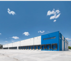
Villaverde Madrid, Spain 17,474 sqm