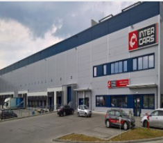
Łódź Urban Logistics Łódź, Poland 36,500 sqm