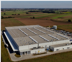
DP Portfolio Legnica Wrocław, Poland 26,030 sqm