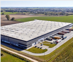
DP Portfolio Toruń Toruń, Poland 30,308 sqm