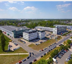
Distribution Park Żerań Warsaw, Poland 44,500 sqm