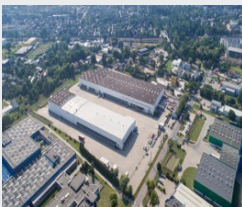
Raben Park Grodzisk Mazowiecki Grodzisk Mazowiecki, PL 29,900 sqm