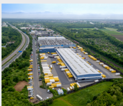
Maintal Logistics Frankfurt, Germany 35,877 sqm