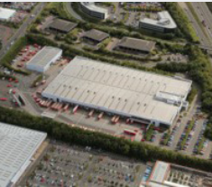
Royal Mail Edinburgh, UK 20,043 sqm