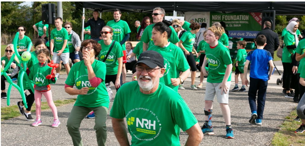
A Family Fun Run at Cherrywood.