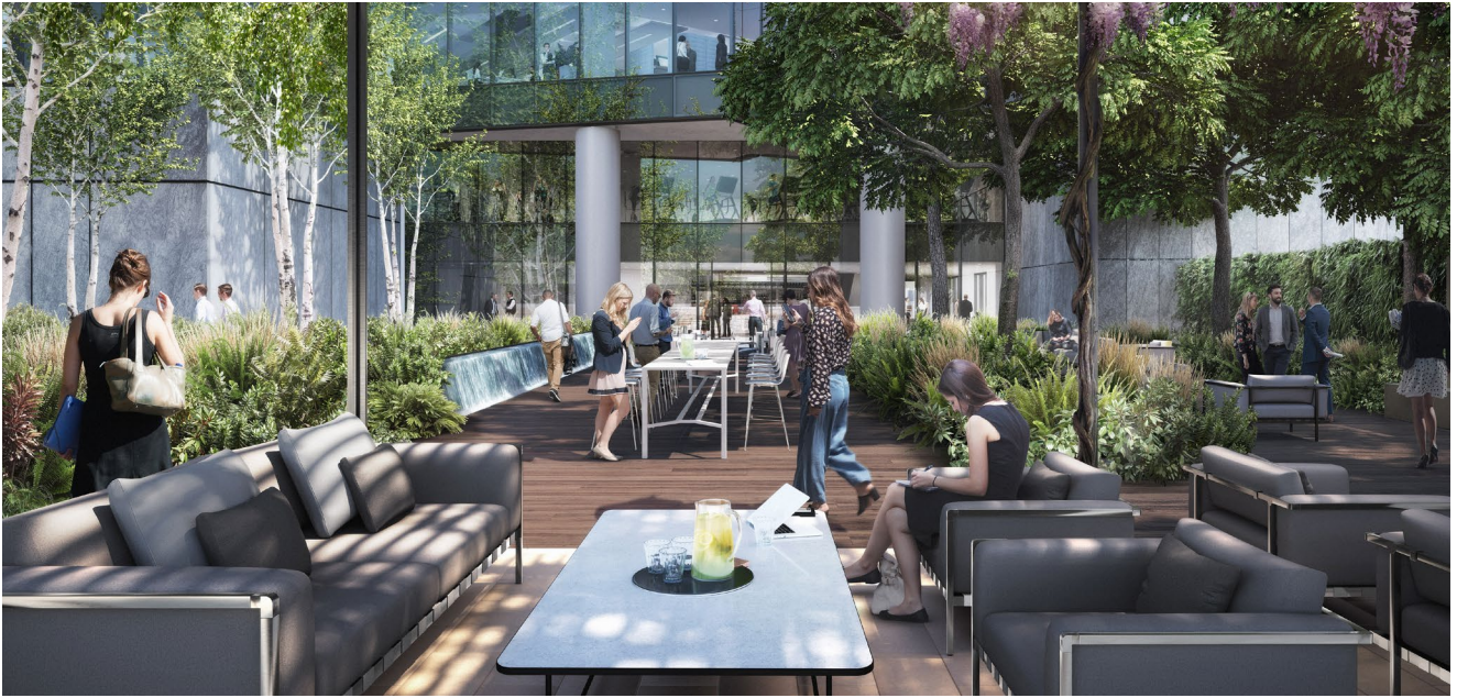
The Roof Deck at South Station in Boston will provide tranquil outdoor space high above the city.

Hardware is the buildings, plazas and alleyways that create the structure of a place. Because the built environment sets the stage for site programming and retail activation – the software – it must be designed with the full spectrum of both in mind. From community events, like farmers markets and charity runs, to concerts, pop-up shops, and food festivals, programming and retail activation must be carefully planned, proactively implemented, and continually refreshed to maintain relevance and vitality.