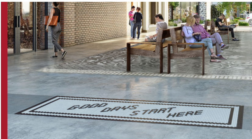
The Instagrammable #fentonfloors bring levity to the space – and set the tone for a day at Fenton.