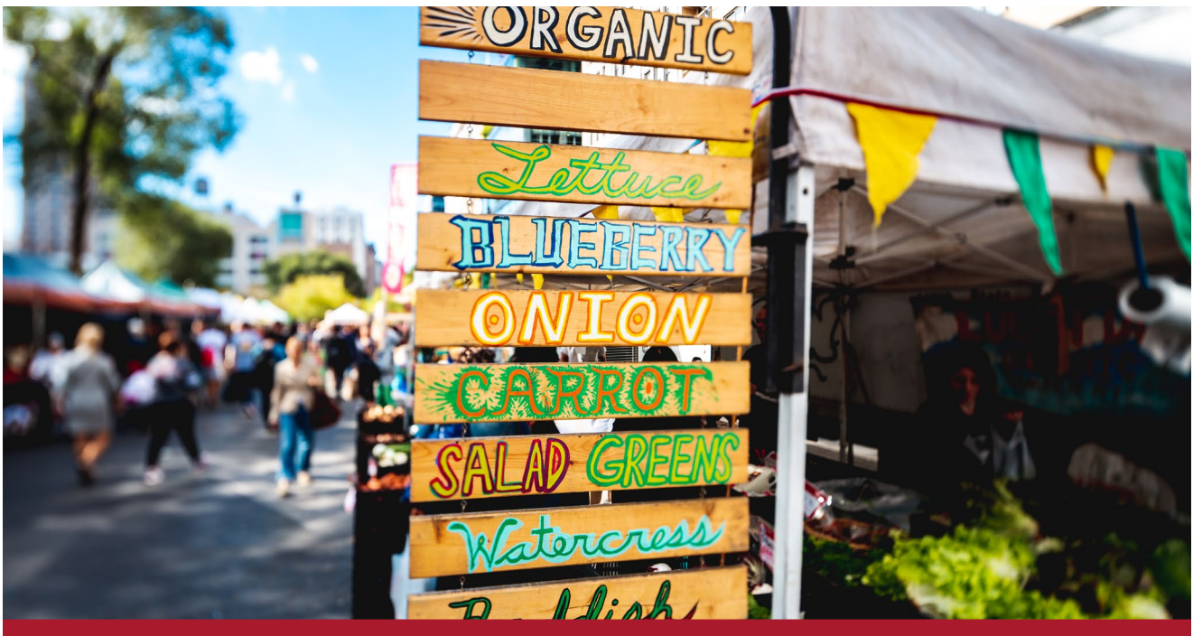
Events such as farmer's markets activate space and community.