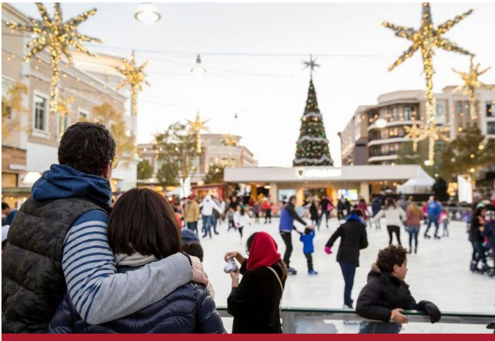
The ice rink at Avalon is a favorite wintertime destination.

When it comes time to sell a mixed-use, placemaded development, it’s critical to build continued programming and activation into the plan. “You wouldn’t want to strip the programming out – it devalues the asset,” Scoville cautions, “and it shouldn’t be siloed by use or done by an off-site company that has no skin in the game,” he adds.