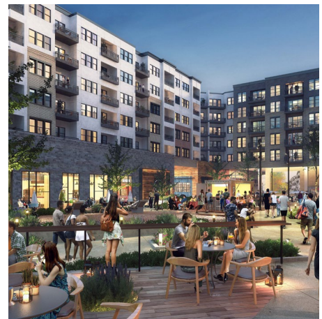
Fenton's outdoor spaces light up as the nightlife begins.