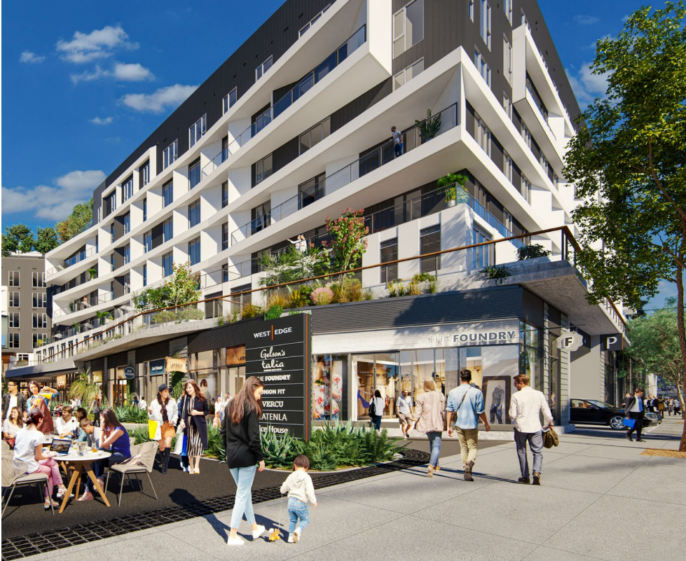
The planned synergies between retail, office and residential uses – and the blending of indoor and outdoor space – should make West Edge in LA a prime placemaking destination.