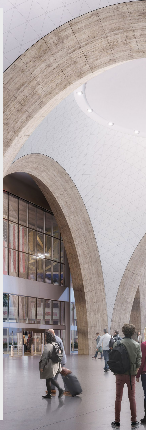
A rendering of the reimagined concourse at South Station.