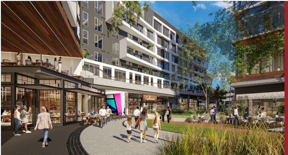
West Edge residents and office tenants will enjoy a curated retail experience that utilizes indoor and outdoor space.

Planning the right retail in a space – and finding the right balance of soft goods, food and beverage, and entertainment – is a critical component of placemaking, as well. More than a collection of restaurants and shops, a rich retail experience incorporates and reflects the lifestyle, wellness and entertainment preferences of the people who will live, work and visit the place, and it's also a key consideration for businesses seeking office space. “As we’ve been leasing the office building at West Edge, the first question we get asked isn’t about ceiling heights or parking ratios, it’s ‘Who are the retailers?’,” says Akula.