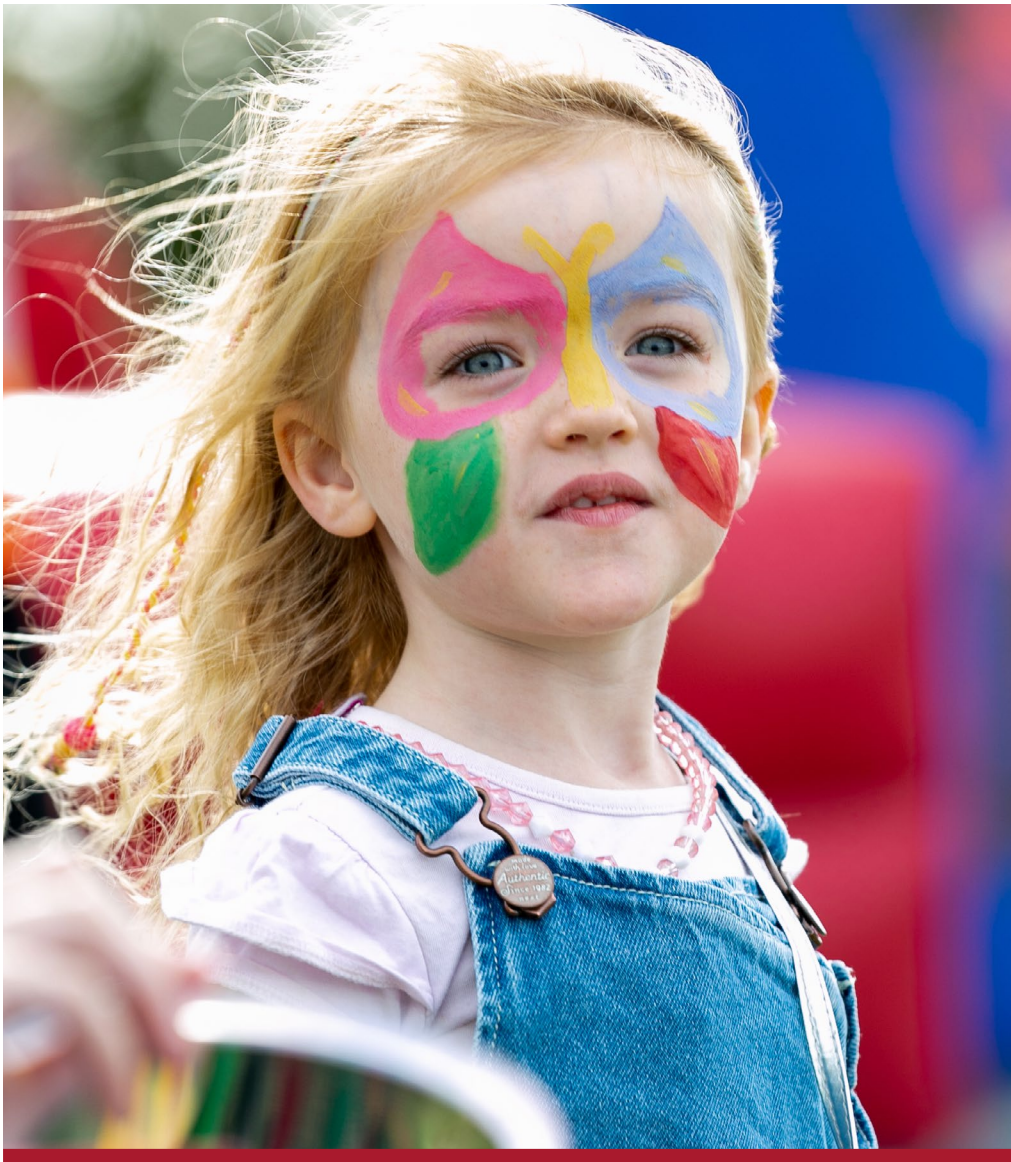
Cherrywood Fun Day welcomed the surrounding community up to the site as construction was just beginning, so people could see what the future held.

While working closely with cities can add complexity to projects, it can also help uncover additional insights and opportunities to address real community needs. "A city knows its people, and knows what will be valuable to the community," says Voelker. "Having the right city partnerships in place is really helpful in understanding what will be valuable."